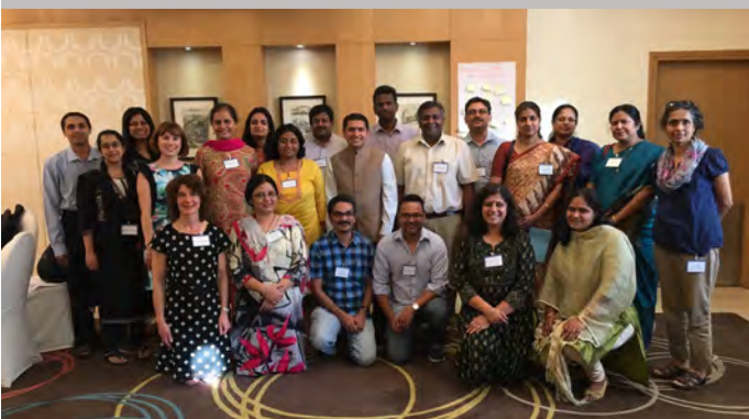
Wellcome-DBT India Alliance Research Management workshop