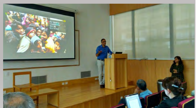
Visit of Delegates from the Bill and Melinda Gates Foundation