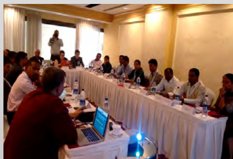
Workshop on Indo-European STI collaboration opportunities Sponsored by the European Commission