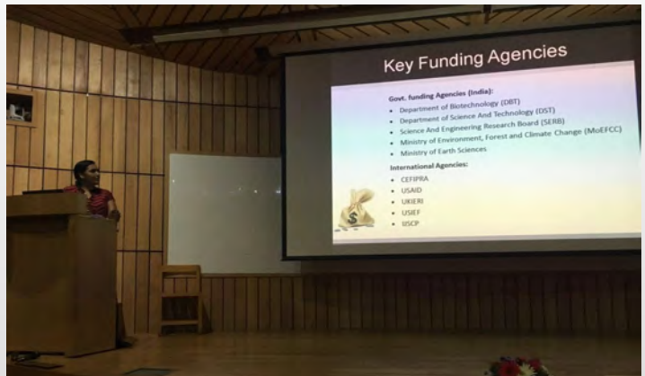
Presentation on International Collaborative Research at Chemical Ecology workshop