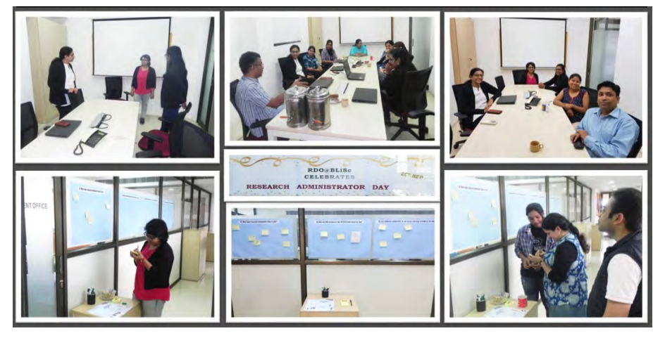
Research Administrator's Day Celebrations at BLiSc