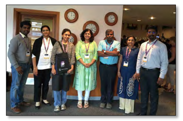
Participation at International Network of Research Management Societies (INORMS) 2018 conference