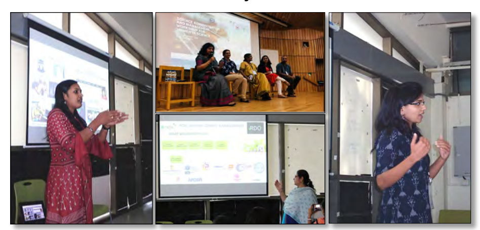
Participation in the Women in Science Administration and Research Management (SAM) workshop conduced at NCBS