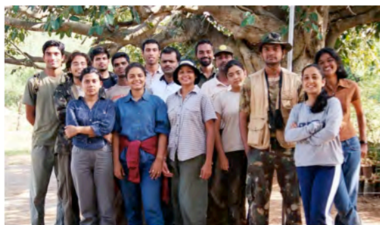
2004 - 2006 Batch

* 11 additional awards pending completion of negotiations with agencies