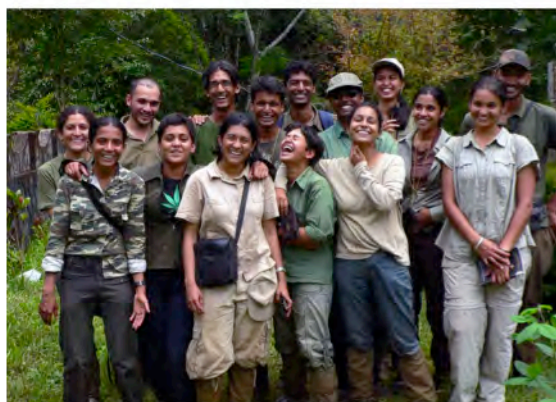
2006 - 2008 Batch

The Masters course in Wildlife Biology and Conservation offered by NCBS, in partnership with several other institutions, has laid particular emphasis on training its students in high quality research. In this two-year program, through their dissertation projects, students apply the theory and skills gained in the preceding 18 months to conceptualize, design, implement, analyze and publish original research. The course provides high quality training to wildlife biologists, at the same time addressing critical areas in wildlife science and conservation.